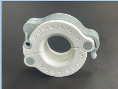
3/4" Mini T/C Pure-Lock Part No: MPLTC-075-NG To suit 25mm O/D T/C Flanges

Stock sizes are 1/2" & 3/4" Mini T/C and 1.0" & 1.5" Standard T/C 2.0", 3.0" & 4.0" Pure-Lock Clamps will be made available during 2024