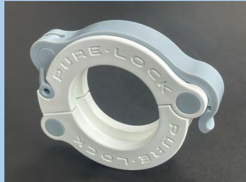
1.0" & 1.5" Pure-Lock Part No: PLTC-150-NG To suit 50.5mm O/D T/C Flanges