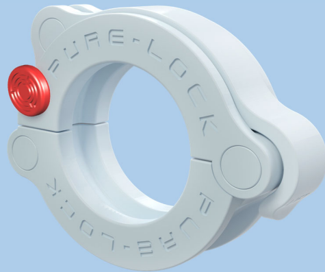
4" T/C Pure-Lock PLTC-400-NG