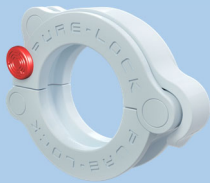
3/4" Mini T/C Pure-Lock MPLTC-075-NG

Stock sizes are 1/2" Mini T/C & 1.5" Standard T/C Additional Clamp Sizes will be made available during 2022