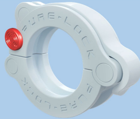
1.0" & 1.5" T/C Pure-Lock PLTC-150-NG