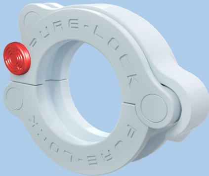
3" T/C Pure-Lock PLTC-300-NG