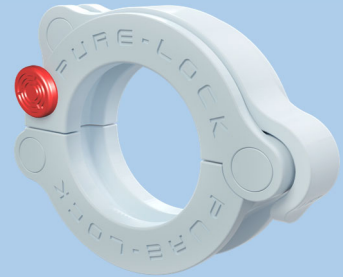
2" T/C Pure-Lock PLTC-200-NG